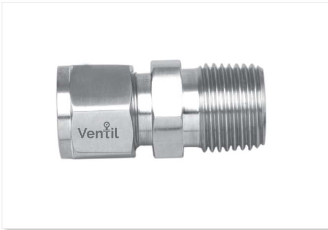
Dimensional Details :